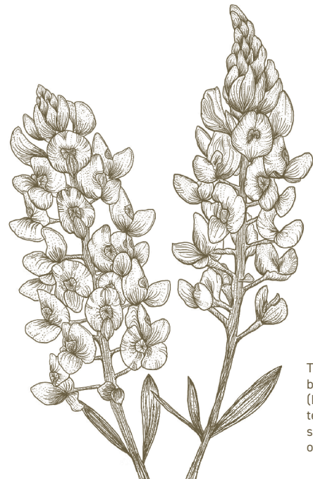
The Texas bluebonnet ( Lupinus texensis ), the state flower of Texas