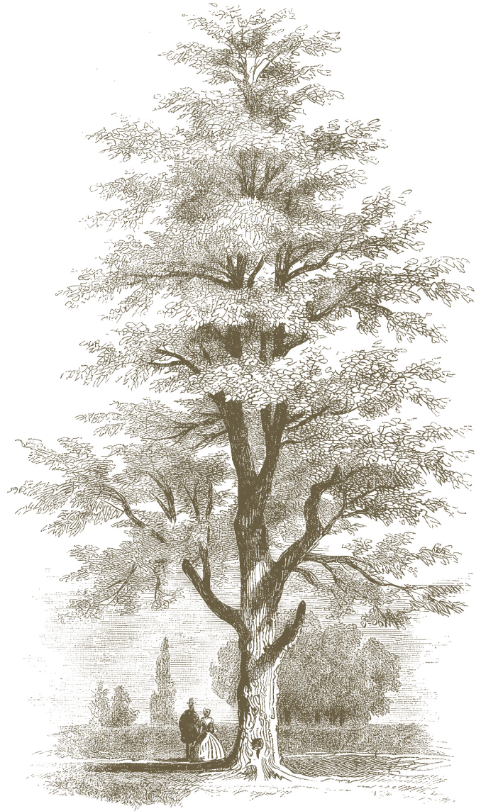
The pecan tree (Carya illinoensis), the state tree of Texas